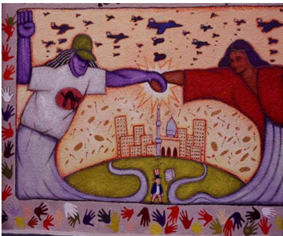
Iraqi art showing the American bombing of Iraq

Recent acting credits: In Darfur at The Public Theater, Palace of the End (Drama League Nomination) at Epic Theater Center; French Lieutenant's Woman at Fulton Opera House; Macbeth , Merry Wives of Windsor with The Acting Company; As You Like It , Romeo and Juliet , Othello , Macbeth , Comedy of Errors at the Old Globe Theater San Diego.